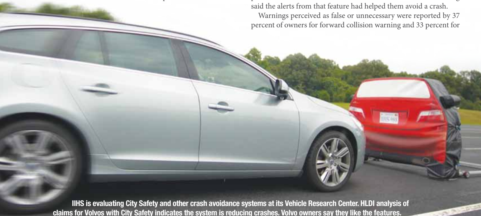
IIHS is evaluating City Safety and other crash avoidance systems at its Vehicle Research Center. HLDI analysis of claims for Volvos with City Safety indicates the system is reducing crashes. Volvo owners say they like the features.

Warnings perceived as false or unnecessary were reported by 37 percent of owners for forward collision warning and 33 percent for