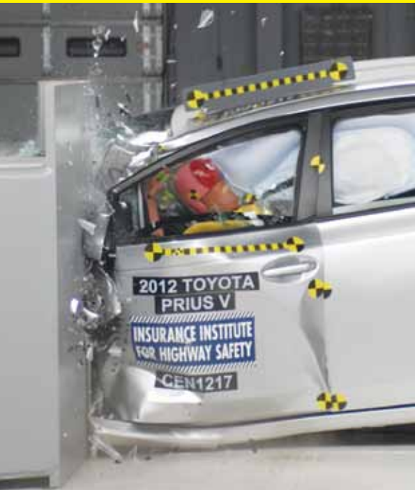
Toyota Prius v

The key to crash protection is a strong safety cage that preserves occupant survival space. Then restraint systems can cushion and protect people.