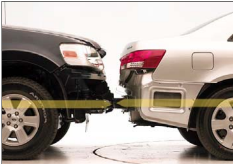
2008 Ford Explorer 2008 Hyundai Sonata