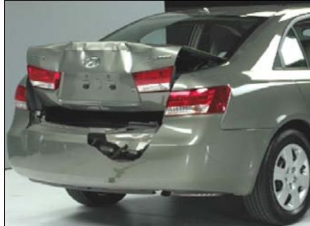
H3: $1,700 Sonata: $4,737