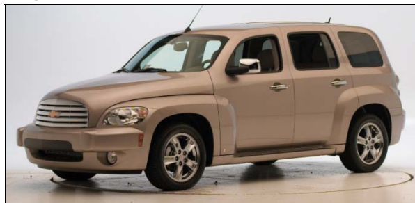
2008 Chevrolet HHR