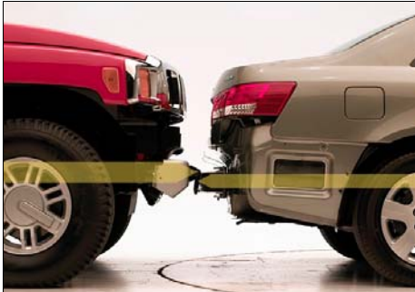
2008 Hummer H3 2008 Hyundai Sonata