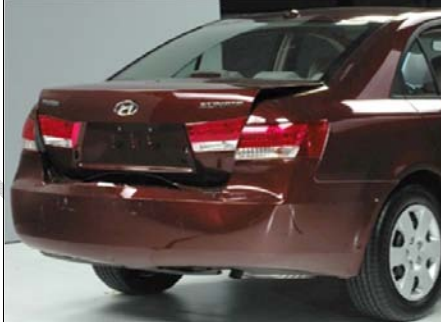
Endeavor: $1,129 Sonata: $3,891