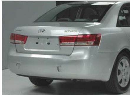
Explorer: $868 Sonata: $1,520