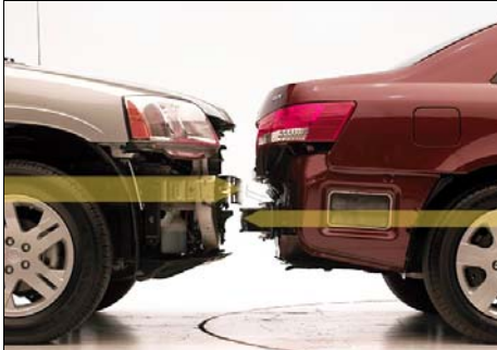
2008 Mitsubishi Endeavor 2008 Hyundai Sonata