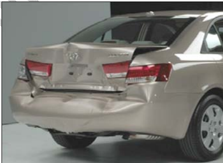
Gr. Cherokee: $1,324 Sonata: $4,633