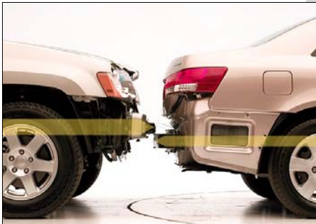
2008 Jeep Gr. Cherokee 2008 Hyundai Sonata