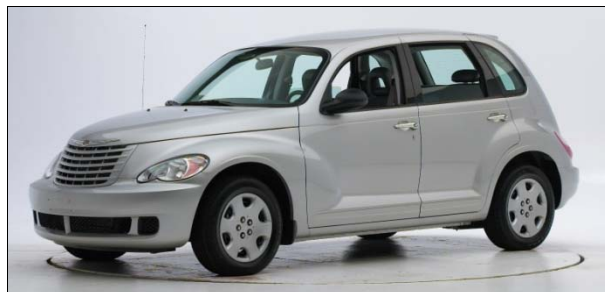
2008 Chrysler PT Cruiser